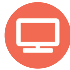
Information Technology (IT)